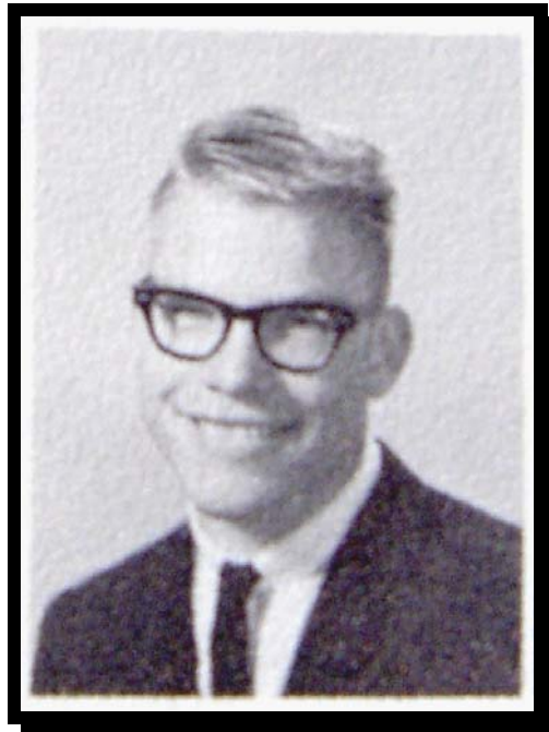
St. Lawrence Yearbook '63, Jr.