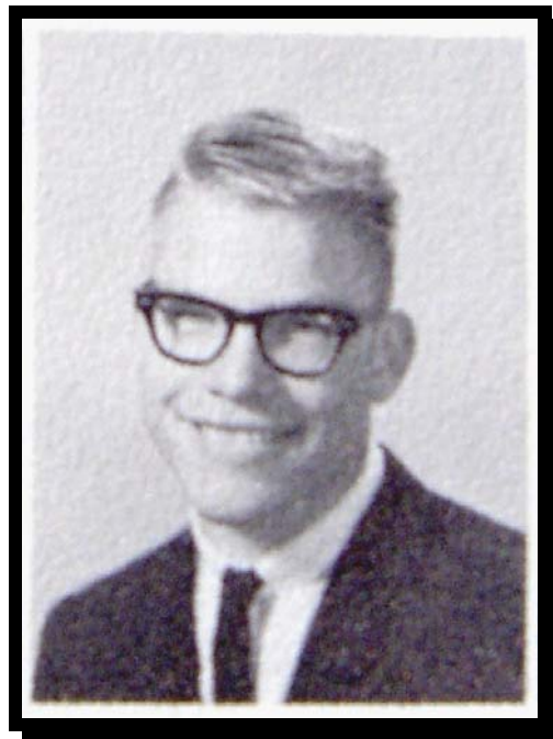
St. Lawrence Yearbook '63, Jr.