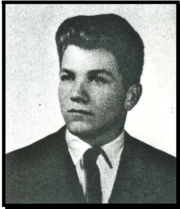
L'Anse Creuse HS Class of '66