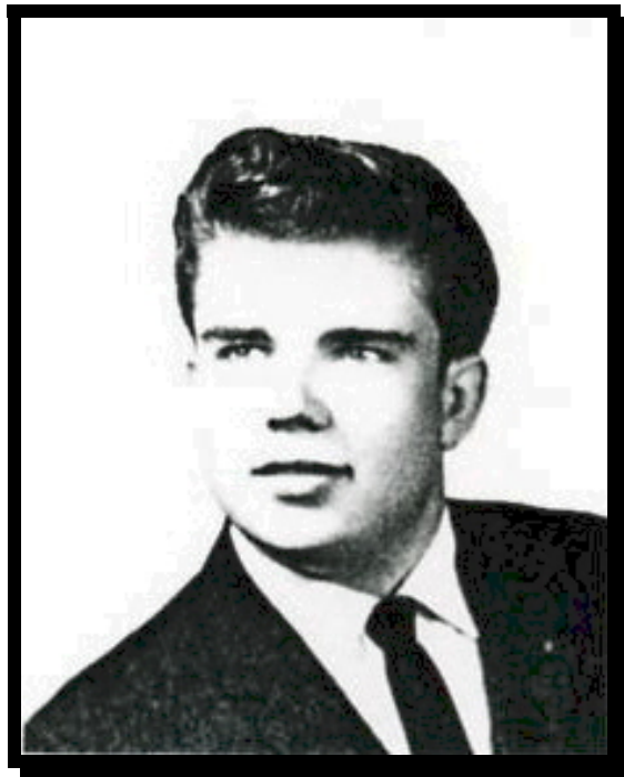
L'Anse Creuse HS '65